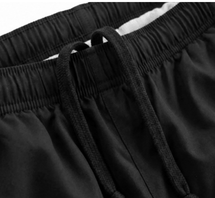
ELASTICATED WAISTBAND + PULL CHORD